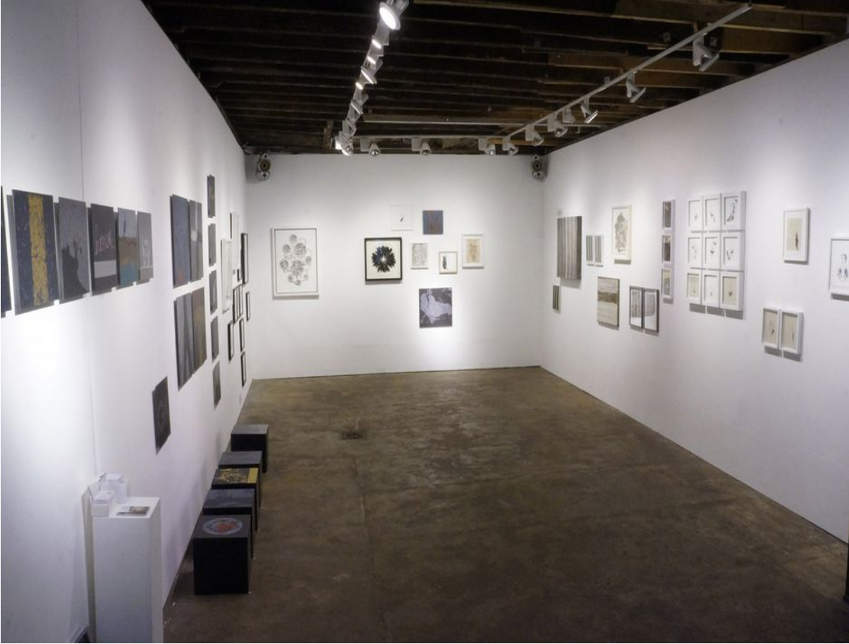
A view into the exhibition