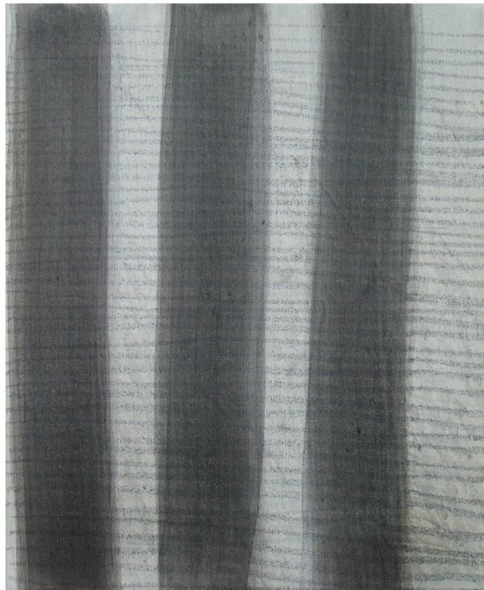
Line 3, 2015

Oil shale and linseed oil on paper, 21 x 15 cm