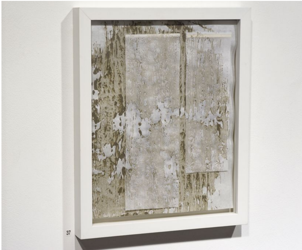
W.T., 2014 Oil Shale on Japanese tissue paper, layered, 29 x 22 cm