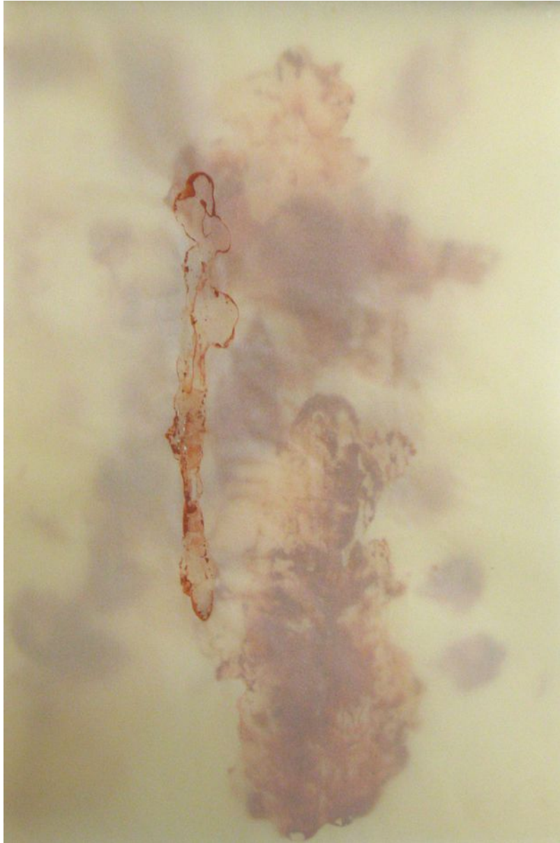
W.T. (Human and owl), 1999/ 2014, Raw Siena on transparent paper, 3 papers, layered, 40 x 30 cm