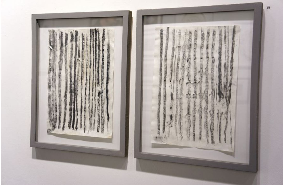
W.T., 2012 Drawing. Coal on paper, treated with water, 2 pieces, each 21 x 29 cm